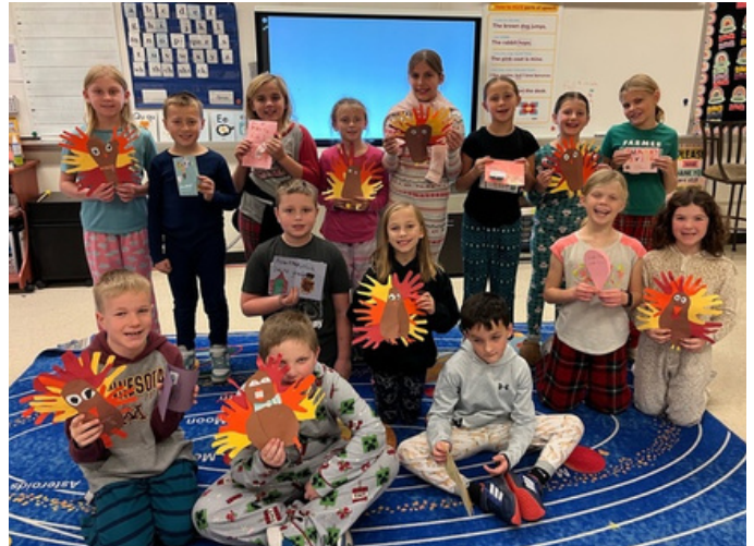
Turkey Cards for Residents of Island Living from Grades 2/3