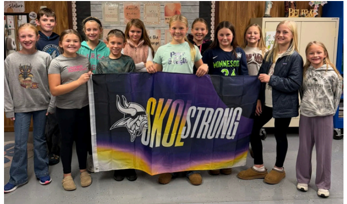
NFelementary Surprise from the Minnesota Vikings for Grade 4

2025-2026 Volume 3 December 1, 2025 (Page 2)