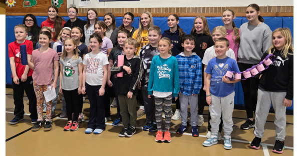
Grade 4 Advent Prayer Service